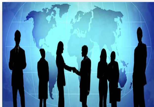
Managment and Administration