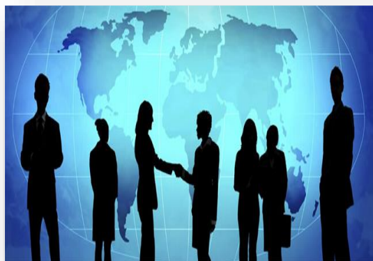
Managment and Administration